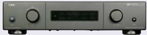
▲ Black Version

▲ Terminals include a pair of balanced XLR inputs, four pairs of high-quality gold-plated RCA inputs, and a pair of REC outs.