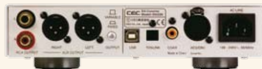
▲ Various input and output terminals. From left to right: RCA/XLR analog output terminals, FIXED / VARIABLE analog output selector button, digital input terminals; USB, TOSLINK, COAXIAL, AES/EBU, and power socket.