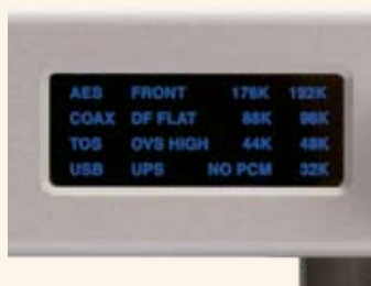
◀ DA53N interior with the red casings for the two LEF amplifier modules visible.